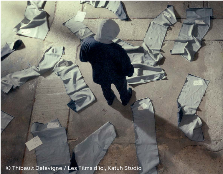
© Thibault Delavigne / Les Films d'ici, Katuh Studio