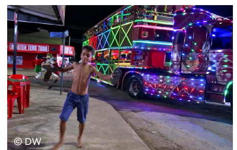
The Hurricane Truck of Happiness in Brazil