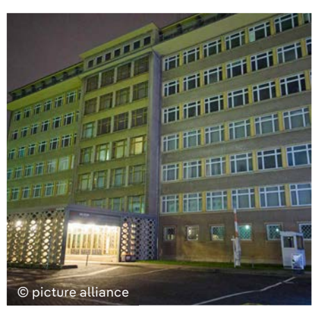
The Stasi Museum in Berlin