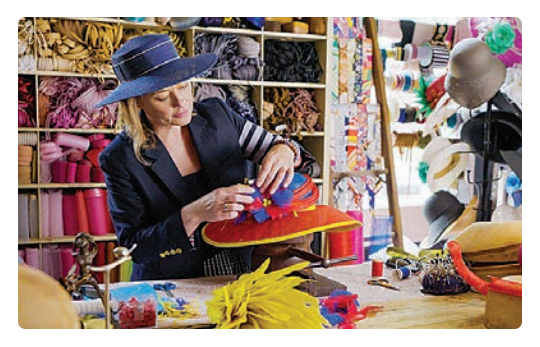
American Made with Love THURSDAY JUNE 5, 11:00PM