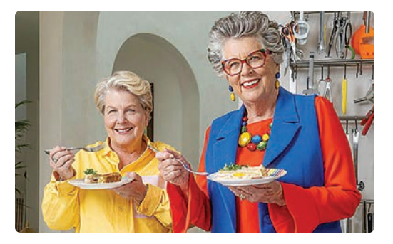
Prue Leith's Cotswold Kitchen SUNDAY JUNE 1, 1:00PM &