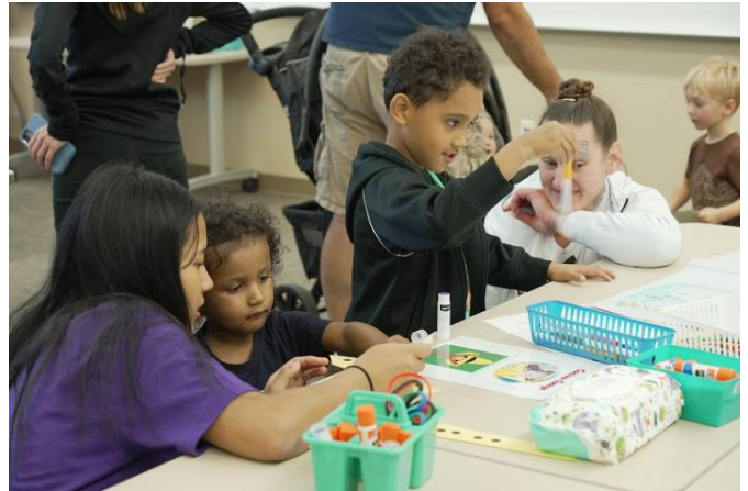
WQPT’s 2024 Imagination Station featured unique learning stations, with STEAM based activities.